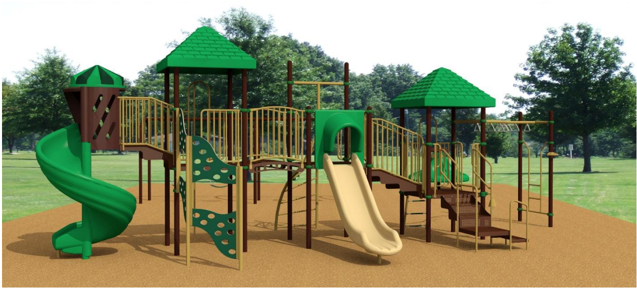
FUTURE CSSHOA PLAYGROUND